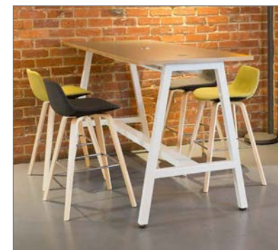
1800mm x 800mm Bench table with MFC top with radiused edges Metal leg frame